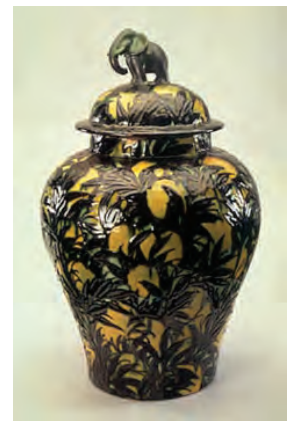
„Zitronenvase“ (1921-25) Max Laeuger